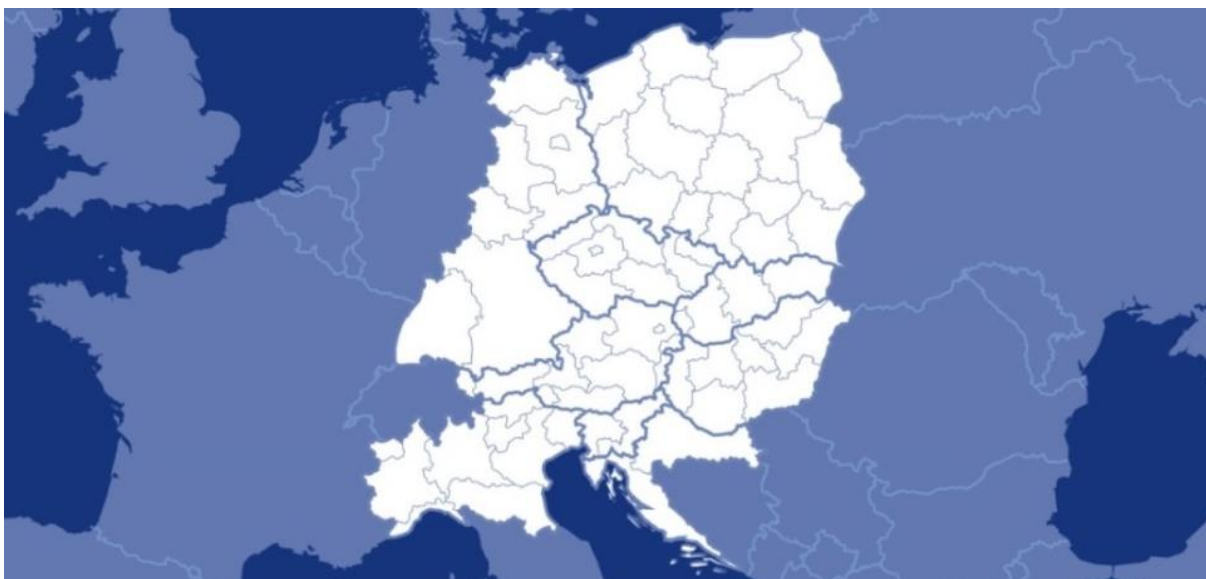
Figure 1: Programme area of Interreg CENTRAL EUROPE

Covering an area of over one million square km the new Interreg CENTRAL EUROPE Programme is home to around 146 million people. Nine European Union (EU) Member States cooperate in the programme, including all regions from Austria, Croatia, the Czech Republic, Hungary, Poland, Slovakia and Slovenia, as well as eight Länder from Germany (Baden-Württemberg, Bayern, Berlin, Brandenburg, Mecklenburg-Vorpommern, Sachsen, Sachsen-Anhalt, Thüringen) and nine regions from Italy (Emilia-Romagna, Friuli Venezia Giulia, Liguria, Lombardia, Piemonte, Provincia Autonoma Bolzano, Provincia Autonoma Trento, Valle d'Aosta, and Veneto). In total, the programme area is made up of 76 statistical NUTS 2 regions.